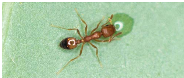
Figure 2. Pharaoh ant.

An interview with each apartment dweller is a good way to begin to locate areas of ant activity, and