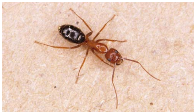
Figure 3. Florida carpenter ant.

Although baits are available, the primary methods for carpenter ant (Figure 3) control are nest and barrier treatments with residual insecticides. How can knowledge of trailing behavior be applied to these methods of control?