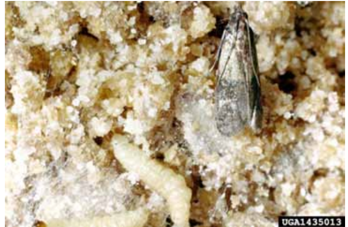
Figure 1. Indian-meal moth larva, adult.

The Indian-meal moth (Fig. 1) is easily distinguished from other grain-infesting moths by the markings of its forewings. The outer two-thirds of the wings are brown with a copper luster. The inner wing area is whitish gray. The female moth deposits her eggs singly or in groups on the food material. After a few days, the eggs hatch and small whitish larvae emerge. These larvae feed on broken grains or grain products. The larvae are about one inch long when fully grown. They are dirty white, sometimes varying to greenish or pinkish hues. The larva spins a silken cocoon and transforms into a light brown pupa. The moth emerges about a week later. During warm periods, the entire life cycle may take only six to eight weeks.