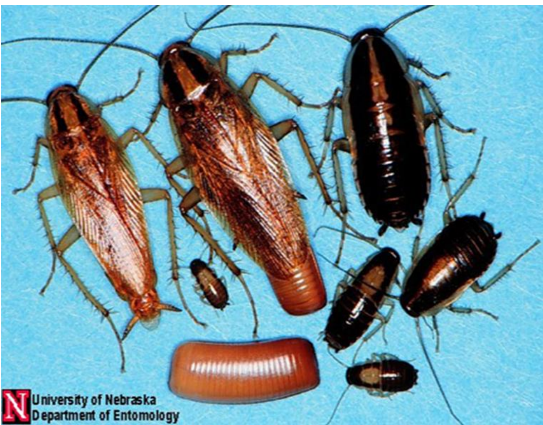
German cockroaches: ½ inch adult male (left) and female (with egg case), darker babies or nymphs (white spot on back) and an egg case.

German cockroaches cause and trigger asthma. Help us keep the building pest-free by doing your part in pest control: