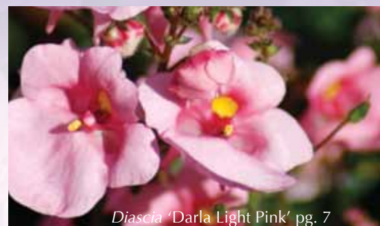
Diascia 'Darla Light Pink' pg. 7

Abelia x grandiflora 'Kaleidoscope,' 'Canyon Creek' – Flowering Abelia. Canyon Creek and Kaleidoscope are two great new selections valued for their colorful variegated foliage. Both thrive in full sun and grow to about 3 feet tall. (E, OE, P, WR)