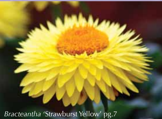
Bracteantha 'Strawburst Yellow' pg.7

Cercis canadensis 'Hearts of Gold' – First known redbud with yellow foliage. With a mature height of only about 15 feet and an 18-foot spread, Hearts of Gold would make an excellent feature in any lawn. Hearts of Gold should bloom its first year and appears to be a faster grower than other cultivars of Cercis , growing 10 feet in its first five years. (BC)