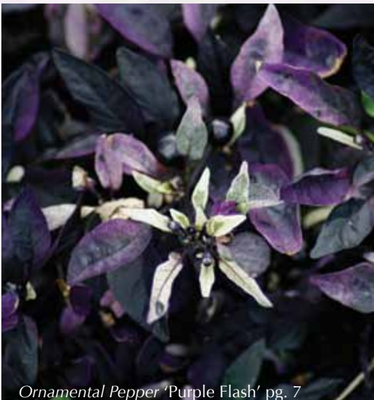
Ornamental Pepper 'Purple Flash' pg. 7

Bracteantha 'Strawburst Yellow' from Fischer boasted eye-catching bright yellow blooms. Dense, uniform plants held numerous blooms all summer long.