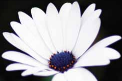
Osteospermum 'Asti White' pg. 7

Euphorbia characias 'Shorty' – Shorty Spurge. A great drought-tolerant perennial growing to just 2 feet tall and 2 feet wide. The narrow blue recurved-edge leaves take on a purple hue in the winter months and are topped with short stalks of yellow flowers in March/April. Good drainage is the key for all E. characias forms and hybrids; don't forget to cut them back severely after flowering. (WR)