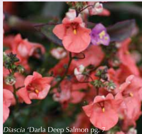
Diascia 'Darla Deep Salmon' pg. 7

Geranium 'Mystical Rose' was a profuse bloomer with a deep dusty rose color. From J.P. Bartlett, it was beautiful all season. (SP)