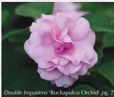
Double Impatiens 'Rockapulco Orchid' pg. 7

Allium 'Ambassador' – Giant Onion. This new hybrid has dramatic, large round blooms atop thick stems reaching up to 4 to 5 feet in height. Plant bulbs in the fall for a beautiful show in mid-summer. As with other alliums, it has edible and medicinal uses.