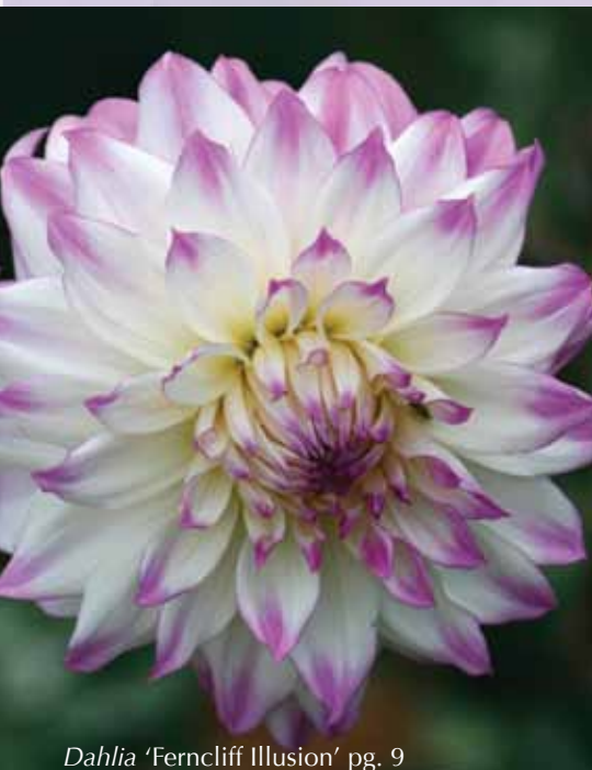
Dahlia 'Ferncliff Illusion' pg. 9

Senecio confusus – Mexican Flame Vine. This annual vine in the Asteraceae family is a vigorous grower, producing loads of bright orange daisy-type flowers all season. The 2-inch flowers stand out against the almost velvety dark green foliage. (P)