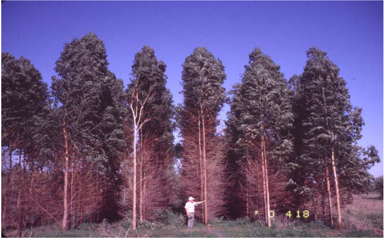
3-year-old Cottonwood Clones